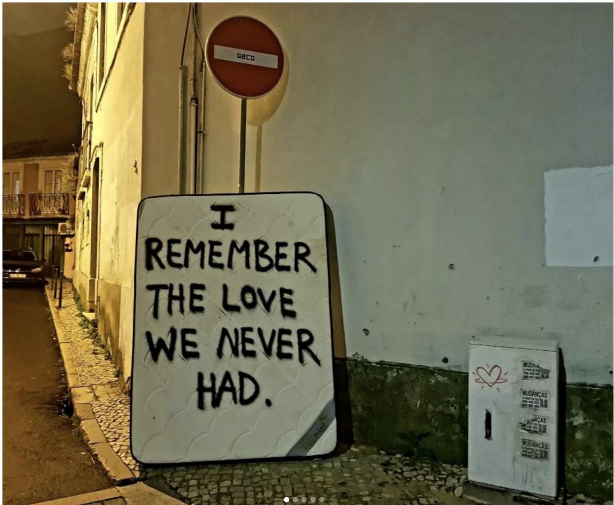
An example of Anushka Anushka's work.

mattresses with poetic sayings using her spray can and then photographs them. Anushka will create an interactive artwork live on site with the CIOmove participants.