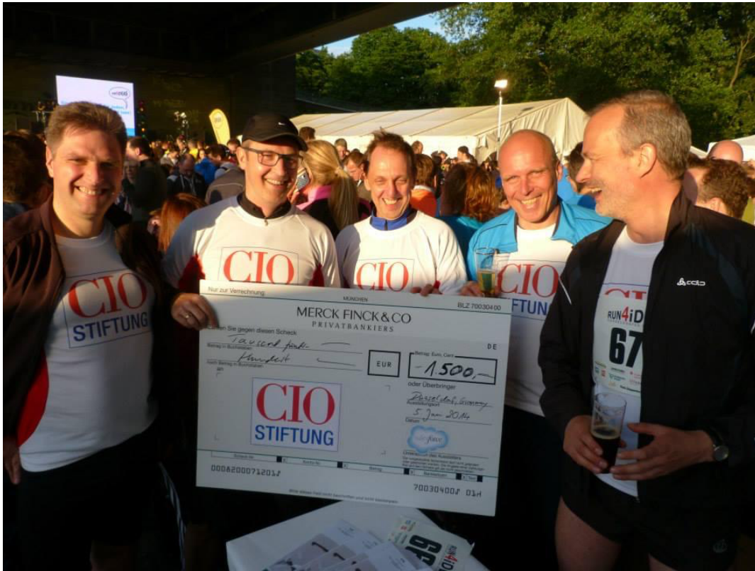
Remember 2014 1st CEO Charity Run

9.30 am Breakfast at The Lodge Hotel Porto